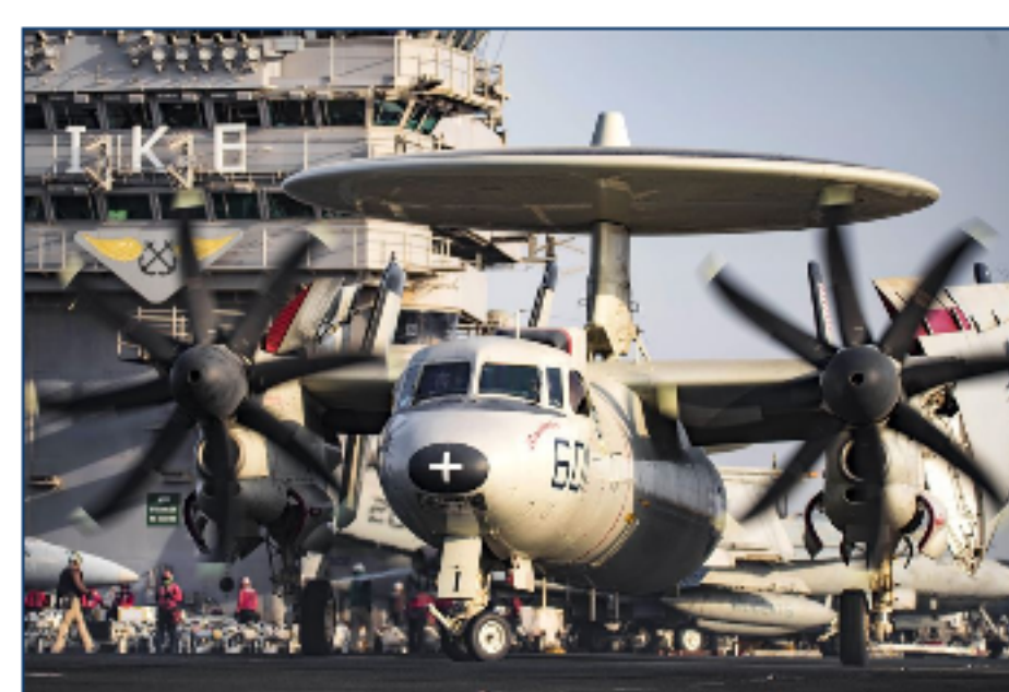
Sailors Support Operation Inherent Resolve in Arabian Gulf