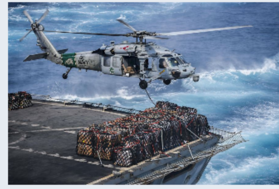
An MH-60S Seahawk helicopter prepares to deliver cargo to the flight deck of the aircraft carrier USS Dwight D. Eisenhower during a replenishment with the fast-combat support ship USNS Arctic in the Arabian Gulf, Aug. 12, 2016. The Eisenhower is supporting Operation Inherent Resolve, maritime security operations and theater security cooperation efforts in the U.S. 5th Fleet area of operations.

U.S. Department of State Counter-ISIL Efforts