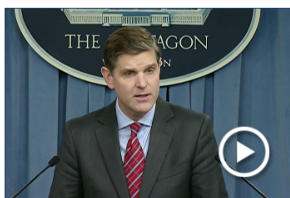
DoD News Update: Press Secretary Briefs Reporters