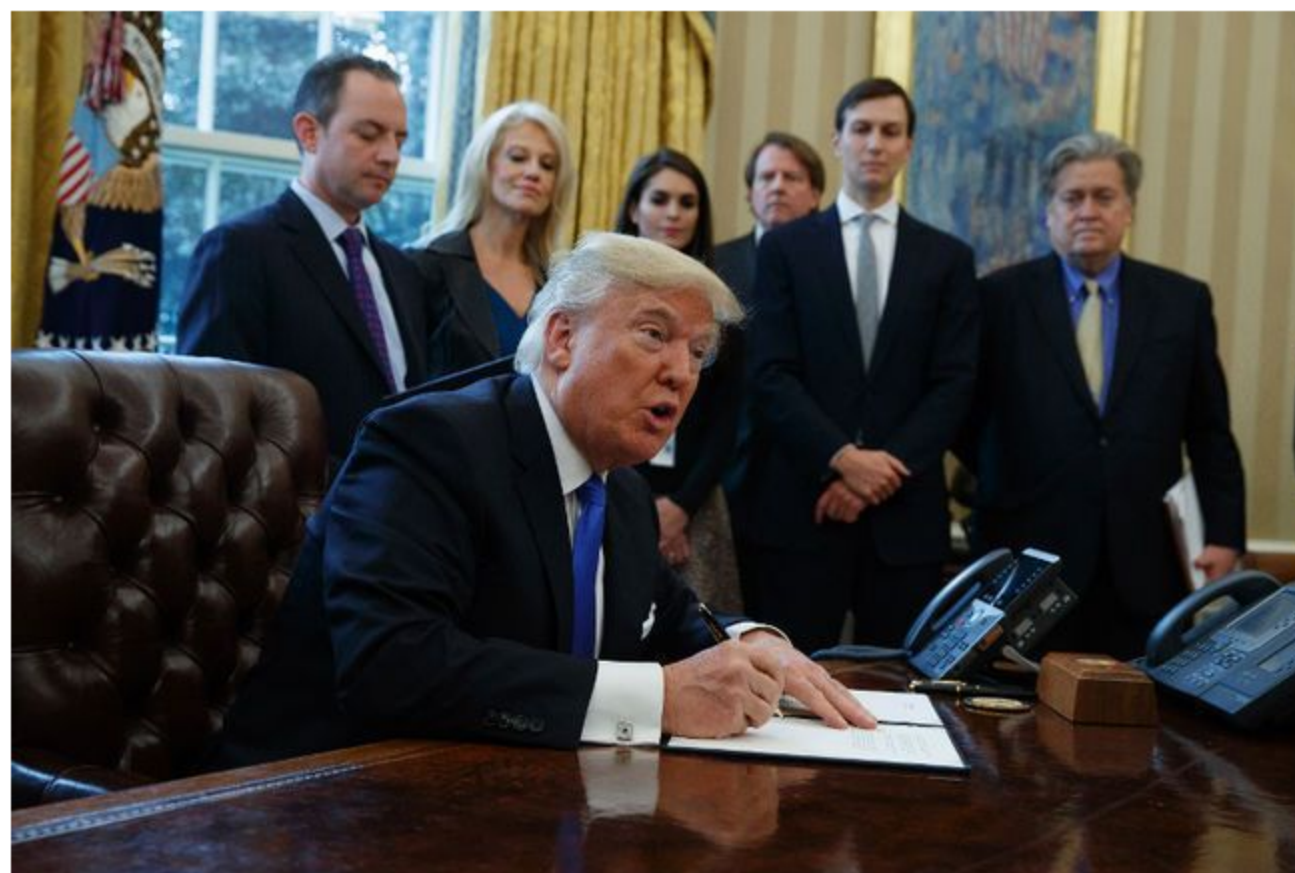
No more funds for Abortion-promotion organizations

He also signed an executive order on Monday barring federal funds from organizations that promote abortion around the world, including the International Planned Parenthood Federation, in what activists say is the president’s first major pro-life action while in office.